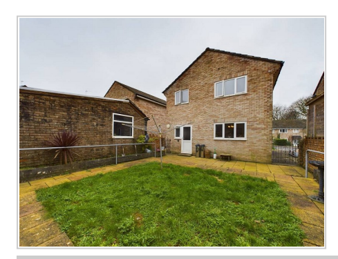
Rear Garden 1

Paved patio area, lawn area, brick wall boundary.