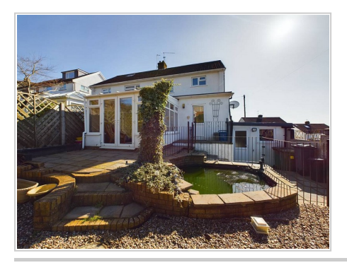
Rear Garden 2