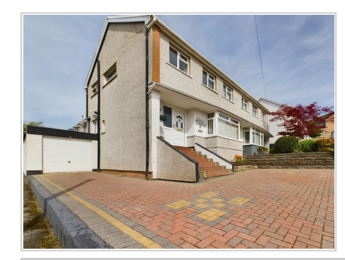
Front & Entrance

Paved driveway, steps leading up to property.