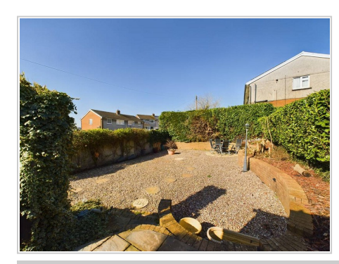
Rear Garden 1

Mature bushes and shrubs, stone area, two patio areas, pond.