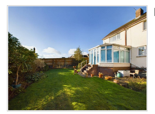
Rear Garden 1

Raised flower beds,lawn area, patio area,side access, mature bushes and shrubs.