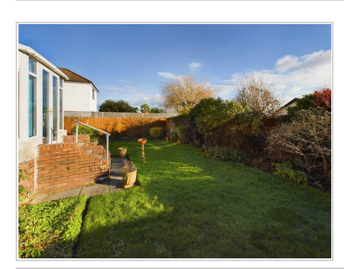
Rear Garden 2